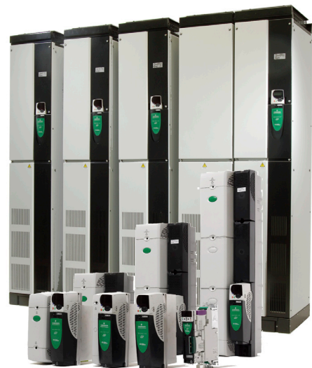
AC Drives fractional to 2,900 hp